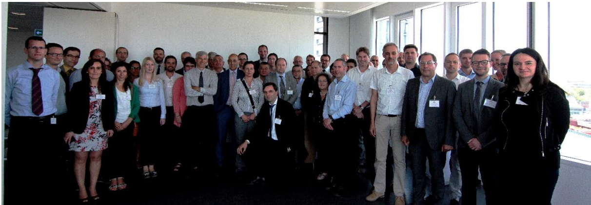
Figure 1: Project Kick-Off Meeting, 21-23.06.2017 in Hamburg

New materials – be it composites or high performance metallic materials – can help making ships and maritime products lighter, more cost efficient, more environmentally friendly and safer. However, to qualify innovative materials for maritime applications, they need to cope with extreme operational scenarios and environmental conditions. Moreover, to be cost efficient they need to be integrated in multi-material ship structures as well as into complex building and global repair, retrofitting and dismantling processes.